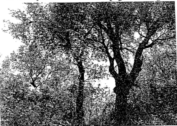
Dayton Canyon Trees