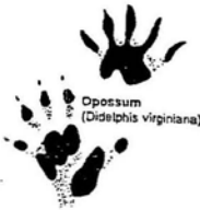
Opossum ( Didelphis virginiana )

Santa Susana Mountain Park Association & Foundation for the Preservation of the Santa Susana Mountains P.O. Box 4831 Chatsworth, CA 91313-4831